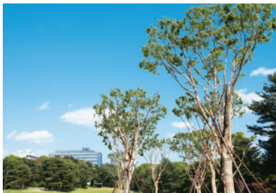
Zelkova transplanted from Aoba Street to Aobayama New Campus